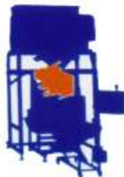
Vertical Packaging Machine