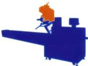
Intermittent Horizontal Packaging Machine