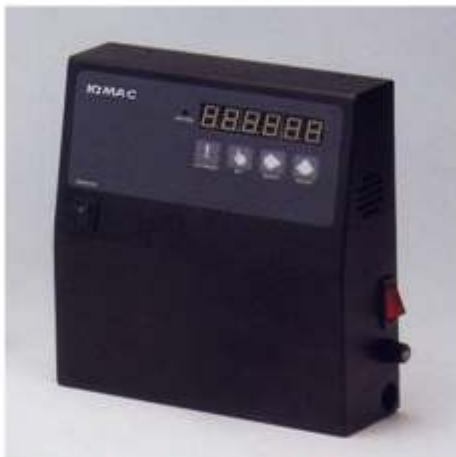
Control Box EASICODER M1