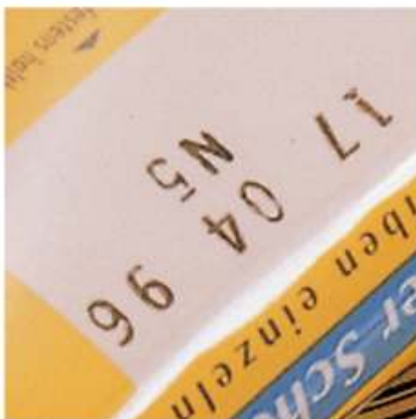
Sample print by Easicoder M1

Easicoder-M1 is very compact rotary coder which uses the instant dry thermo fusible ink, designed to print dates, batch numbers, prices and other variable information on very type of flexible packaging such as cellophane, polypropylene, aluminum, polyester or cardboard, at speed up to 35 M/min on a 30 x 35 mm. printing area. It can be easily installed on flow pack units, horizontal from-fill-seal packaging machine.