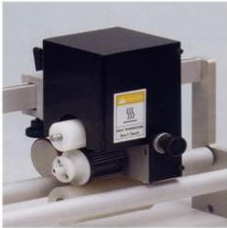
Printhead EASICODER M1